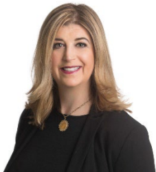
Mayor Brittany Merrifield

The Town of Grand Bay-Westfield Council is composed of: