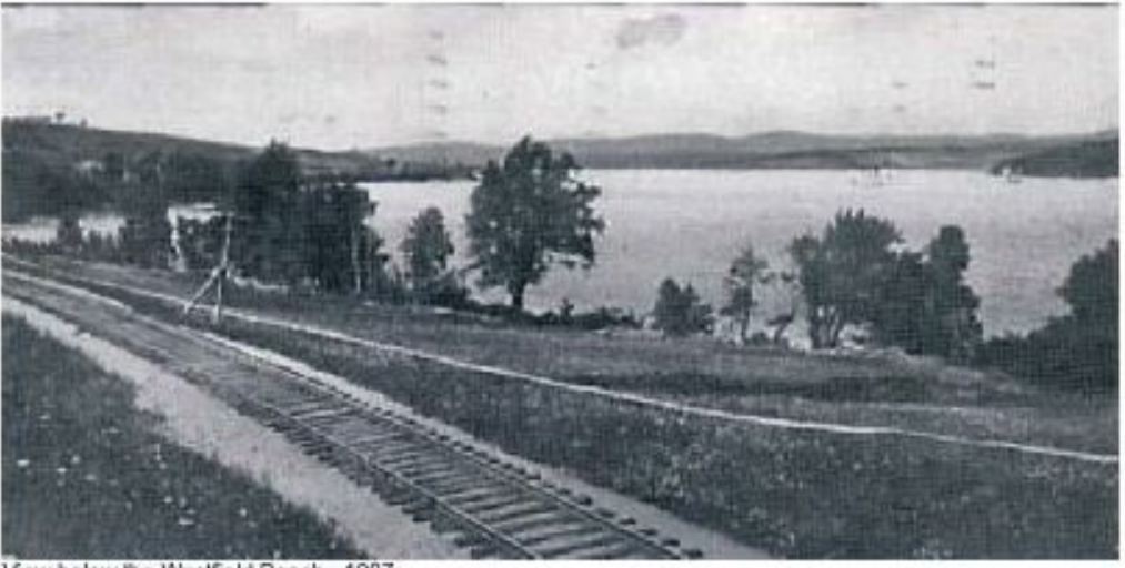
View below the Westfield Beach - 1907 Fanjoy Postcard Collection From: Up Country Memories - Aiton and Bormke - 1988

with participants providing direct input to help shape the plan.