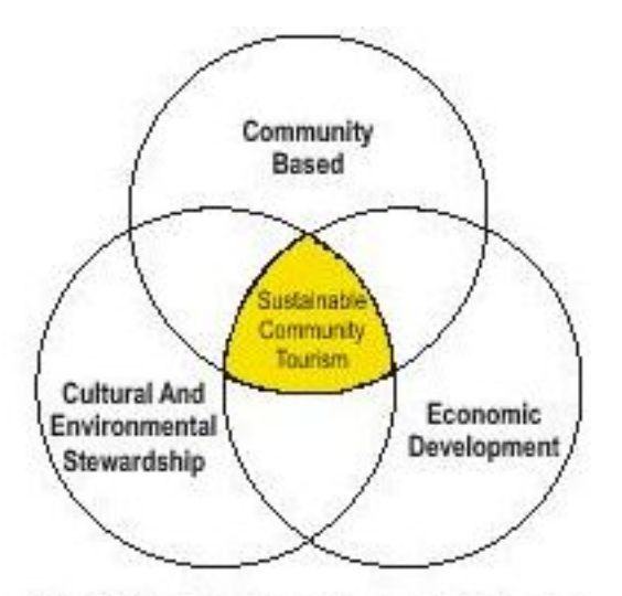
Sustainable Development Model

At the public workshop held on March 19th, BDA presented an outline of the attributes of the sustainable tourist market. The following is a summary of that presentation.