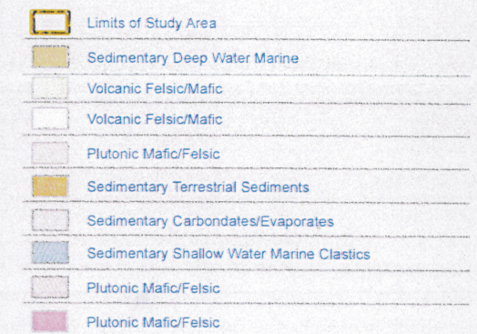
FIGURE 1 BEDROCK GEOLOGY